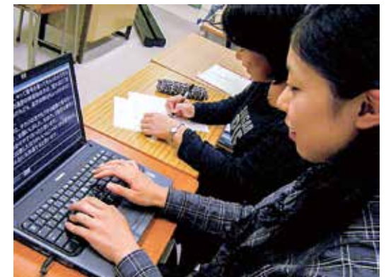
Speech-to-text transcription with laptop for student with hearing impairment

❖ We arrange appropriate academic support with supervision by faculty members with expertise in disability science.