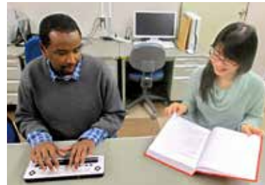
Face-to-face reading for students with visual impairments